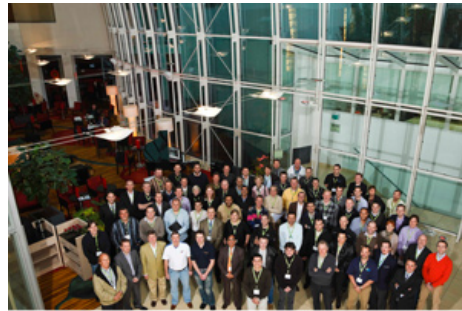
Attendees at the recent Solar Gard European Architectural Summit in Ghent, Belgium.

For more information, visit the website: www.solargard.co.uk