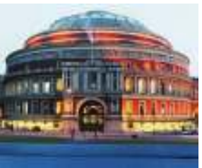
The Royal Albert Hall has installed Armorcoat, an innovative product by Bekaert

The Royal Albert Hall is an instantly recognisable world famous venue. Unfortunately, in the current climate, that also means it has to be protected from any potential terrorist attacks. Key to this is making the venue's 188 windows blast proof, which is why the Hall has installed Armorcoat, an innovative product by Bekaert (manufacturer of Solar Gard ) that affords protection to all of the venue's internal and external glass.