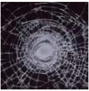
Bekaert's Armorcoat affords protection to all of the venue's internal and external glass

"This was an upgrade to the new Home Office bomb blast standard specification, which is 175 micron film - the old film was 100 micron. We replaced the film on all the external windows and doors and we also went a stage further and put film on all the internal glass in the corridors."